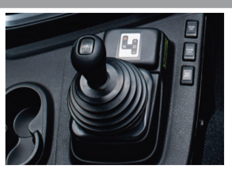
AMT model shown